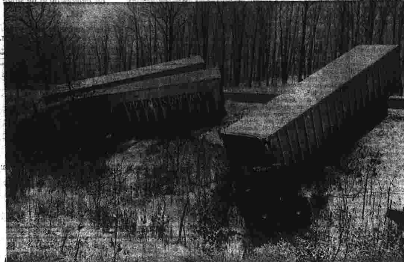
Storm Causes Highway Trailer Pileup These three tractor-trailers—and a fourth—were involved in an accident early this morning on the Wilbur Cross Highway in Tolland...