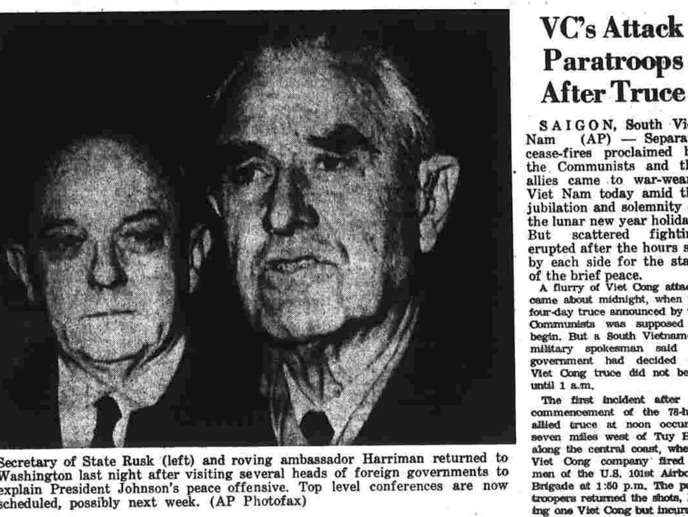
Secretary of State Rusk (left) and roving ambassador Harriman returned to Washington last night after visiting several heads of foreign governments to explain President Johnson's peace offensive.

MADRID, Spain (AP)—An official announcement today said the U.S. B-52 bomber, which crashed after colliding with an aerial tanker Monday over Spain's southeast coast, was carrying "unarmed nuclear armaments."